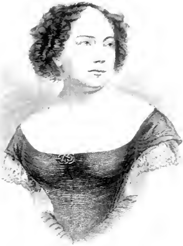
ANNA ELLA CARROLL.